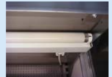
Standard shelf lighting.