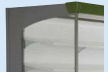
Standard cover plate.